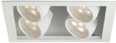
12 3/8" x 12 3/8"