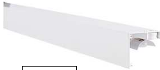
View from front